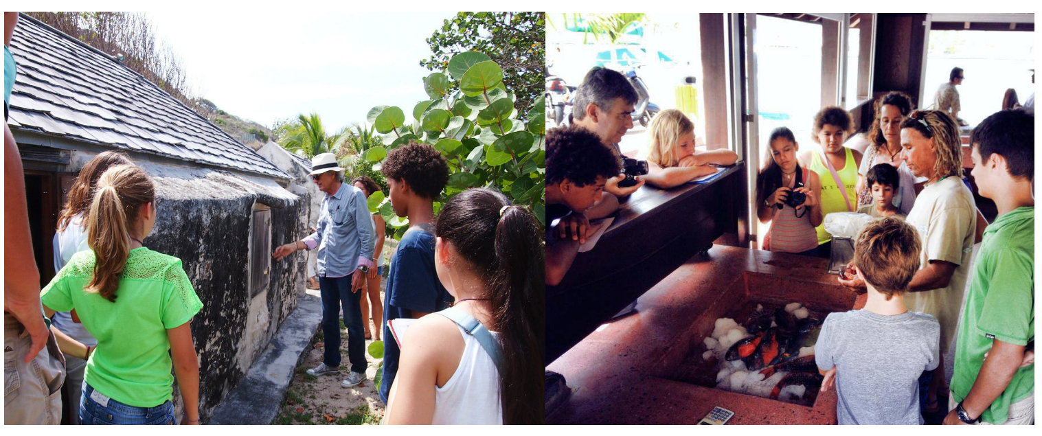
Visit of the tradtionnnal windward cottage, Toiny Hotel

Continuing their exploration of traditional professionals, the students who belong to the Heritage Club, created in February 2013 in partnership with the junior high school, met for a fourth field trip on the theme of traditional architecture. Following a visit to the historic Swedish buildings in Gustavia -the Dinzey House and the